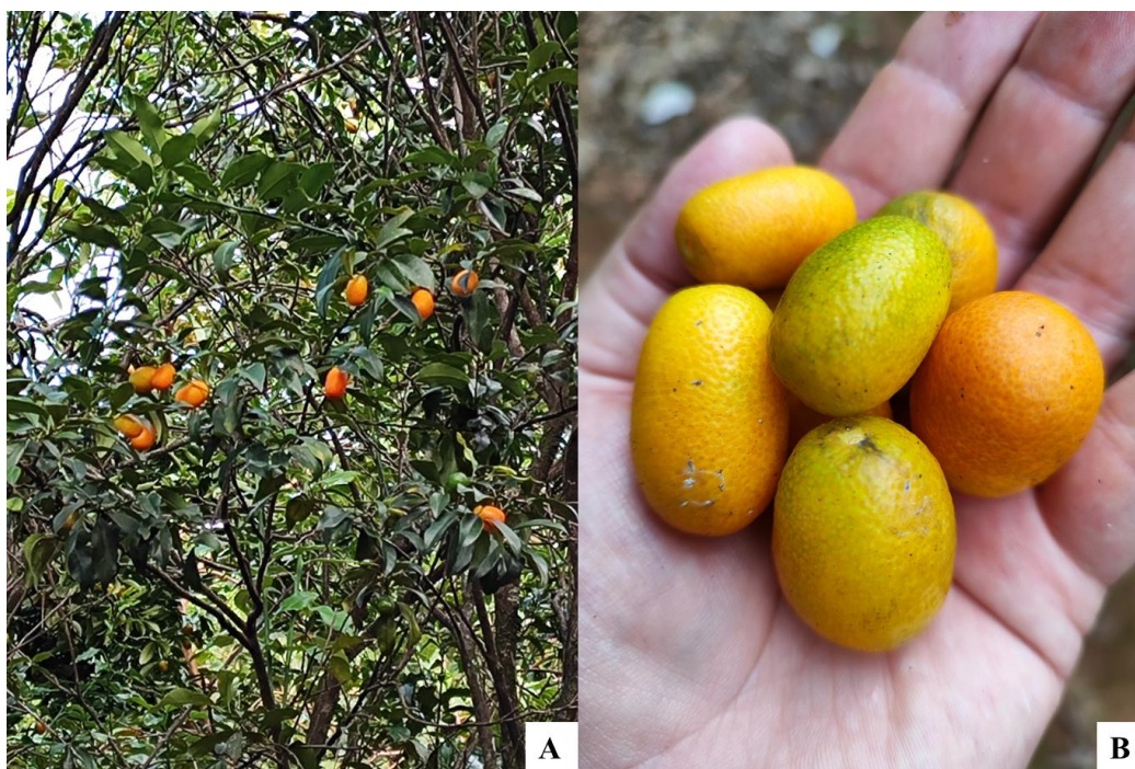
Figure 1. Fortunella margarita tree in fruiting (A) and (B) ripe fruits.

Therefore, this study aimed to evaluate the essential oil of Fortunella margarita regarding its chemical profile and its allelopathic effect in different concentrations on the germination of sunflower ( Helianthus annuus L.) and barley ( Hordeum vulgare L.) seeds in vitro .